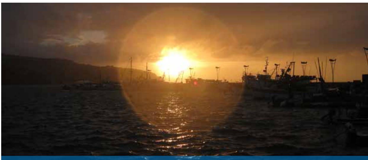
Winner of Round 5, for the topic Trade - key of success is in cross-border cooperation?, of the RCC's Voice of the Region contest: 'Harbour of Possibilities, Koper, Slovenia.

An all-inclusive, regionally-owned and driven cooperation framework, the Regional Cooperation Council (RCC) continued, in the reporting period, to pursue its mandated mission in an effort to meet inter alia, by the support provided to the RCC the expectations of its stakeholders.