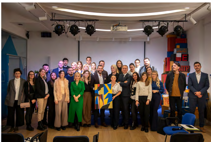
Regional Conference on Youth Cultural Cooperation dubbed Stirring the Cultural Scene: Spotlight on Youth Talents, organized RCC's EU funded Western Balkans Youth Lab 2 took place on 13 November 2024 in Europe House Belgrade

Furthermore, WBYL2 facilitated two Regional Fire-side Talks, bringing together youth representatives from the Western Balkans to engage in open discussions on key issues affecting the region. The "10th Edition – Looking Forward: Exploring New Ways to Strengthen Regional Cooperation," held on 16 September 2024 in Tirana, provided an opportunity