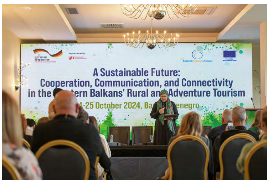
RCC, in collaboration with GIZ, hosted the regional Tourism Conference titled A Sustainable Future: Cooperation, Communication, and Connectivity in the Western Balkans' Rural and Adventure Tourism – Synergising Strategies, in Bar on 24–25 October 2024

Sarajevo with focus on the importance of branding the region as a single tourism destination by focusing on the key factors driving growth in the WB6. The meetings discussed challenges and opportunities and explored good practices in developing a Regional Tourism Branding Roadmap. On 24–25 October 2024, in Bar, RCC, in collaboration with GIZ, hosted the regional Tourism Conference titled “A Sustainable Future: Cooperation, Communication, and Connectivity in the Western Balkans’ Rural and Adventure Tourism – Synergising Strategies.” The event gathered a wide range of stakeholders from across the region, including the TEG, international organisations, tourism associations, and women entrepreneurs from the tourism sector, particularly those involved in RCC’s “Western Balkans Women Entrepreneurs of the Year” initiative.