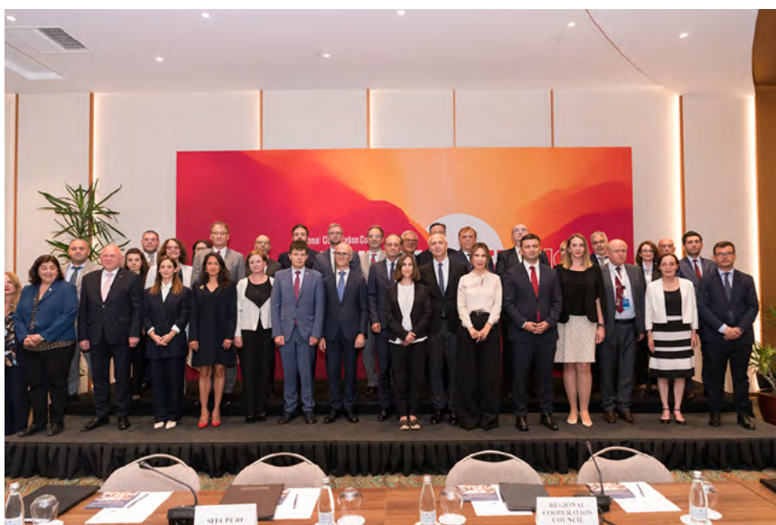
16th Annual Meeting of the Regional Cooperation Council (RCC) took place in Skopje on 12 June 2024

RCC focused on driving forward the Western Balkans region's European integration, strengthening the Common Regional Market (CRM) , and advancing the Green Agenda for the Western Balkans (GAWB) and steering the SEE 2030 Strategy , while deepening cooperation in digitalisation, human capital development, youth engagement, and regional security.