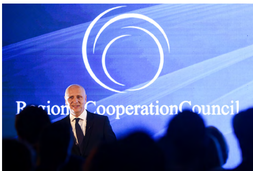
RCC organized several interviews with Secretary General and RCC staff promoting organization's agenda