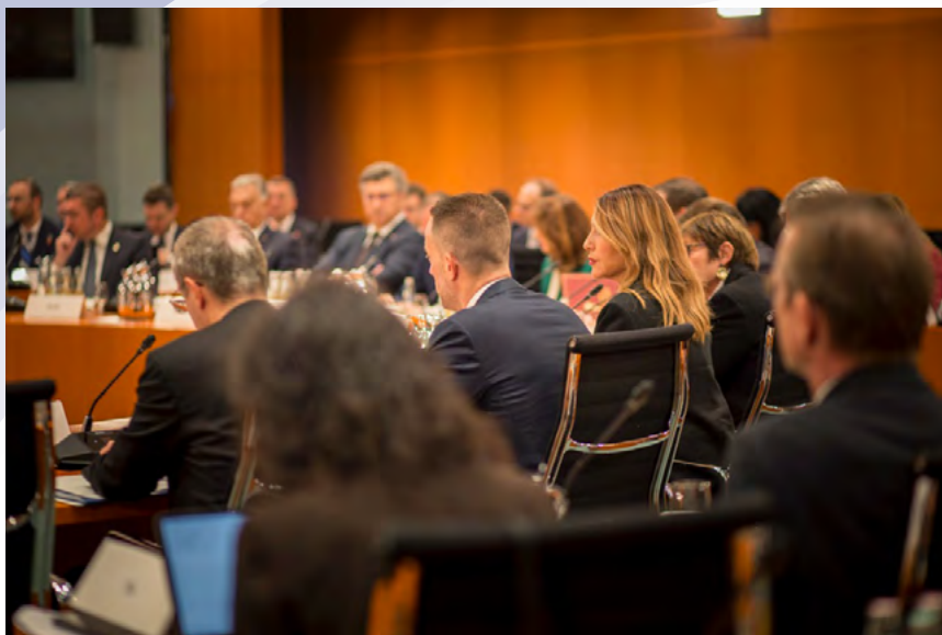
During the Berlin Process Summit held in Berlin on 14 October 2024, WB6 leaders endorsed several landmark agreements and initiatives facilitated by the RCC

on 4 April 2025. This session was in building consensus on the deliverables for the Berlin Process 2025.