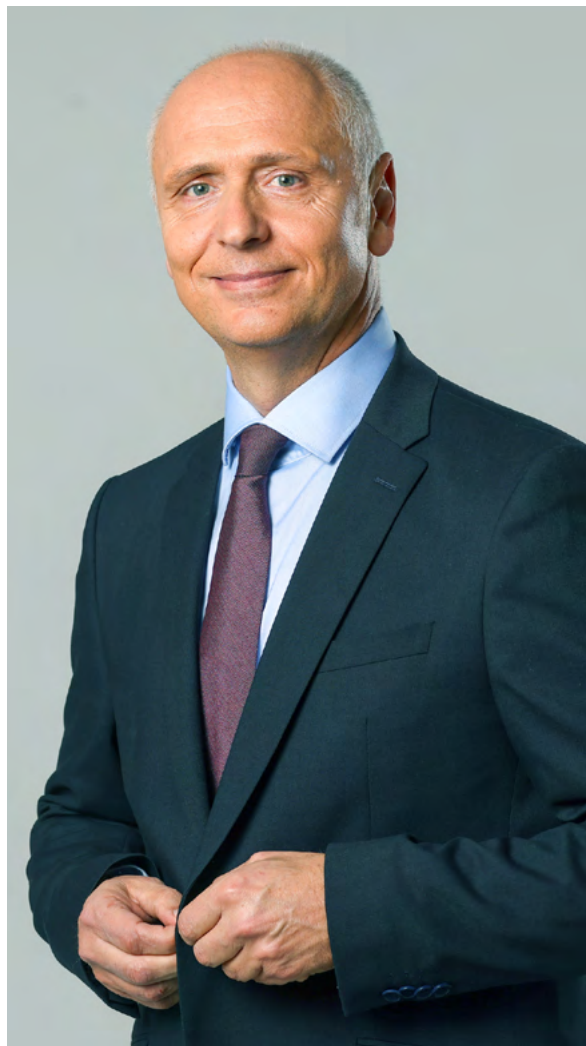
Secretary General of the Regional Cooperation Council (RCC) Amer Kapetanovic