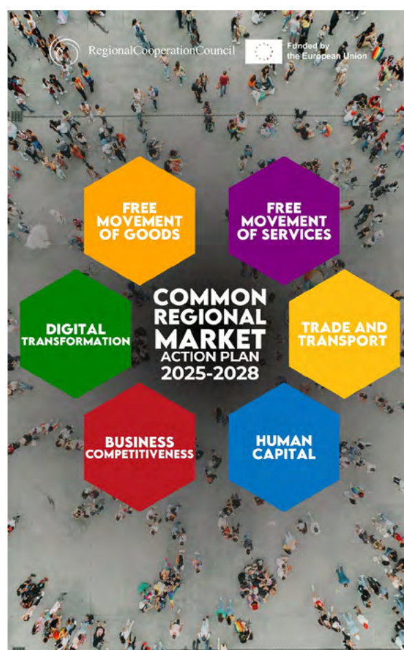
Common Regional Market (CRM) 2025–2028 Plan Action was endorsed at the Berlin Process Summit in October 2024

Innovation and future-proofing the region were further leveraged and promoted through flagship events such as the Balkathon and Butterfly Inno-