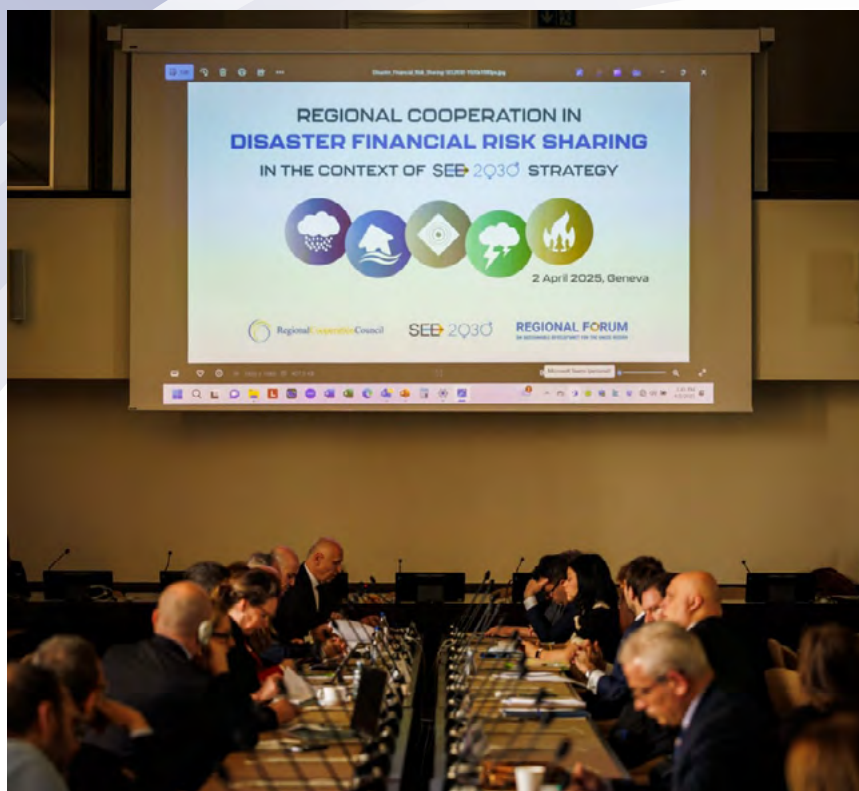
RCC organised discussion on SEE Disaster Risk Sharing on the side-lines of UNECE Regional Forum in Geneva on 2 April 2025

the procedures foreseen by the SEE2030 Strategy, the RCC Secretariat presented this proposal along with the abovementioned accompanying documents to the RCC Board for its approval. The Decision for the establishment of the SEE Regional Network on Disaster Risk Insurance and Risk Sharing and its Terms of Reference were approved by the RCC Board, at its meeting held on 12 March 2025. As foreseen by the Network's Terms of Reference, the RCC Secretariat has now started with the nomination process of the members of this Network by all SEECF participants.