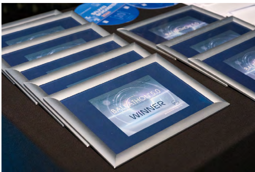
Balkathon, October 2024

Among the key outcomes of the meeting was the agreement to establish Platform for supporting high level dialogue on regional Digital Identity Wallet, with the RCC assuming the role of coordinator and facilitator. This Platform will serve as a central mechanism to support political alignment, technical coordination, and regional cooperation on the implementation of interoperable Digital Identity Wallets, in line with EU standards and practices.