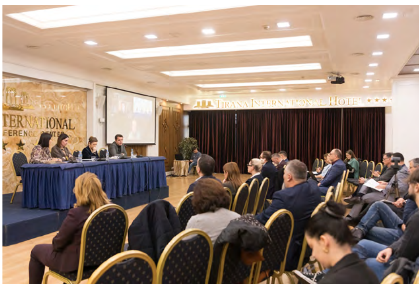
Executive training on the Common Regional Market (CRM) for civil servants from parliaments and ministries across the Western Balkans Six opened on 2 December 2024 in Tirana

RCC engaged actively with presentations in the XXI Conference of the European Integration/Affairs Committees of Countries Participating in the Stabilisation and Association Process in South-East Europe (COSAP) in February 2025 and the Parliamentary Assembly (PA) of the SEECP meeting of the General Committee on Economy, Infrastructure and Energy in April 2025, under the topic "Opportunities for Regional Cooperation in Renewable Energy in SEE".