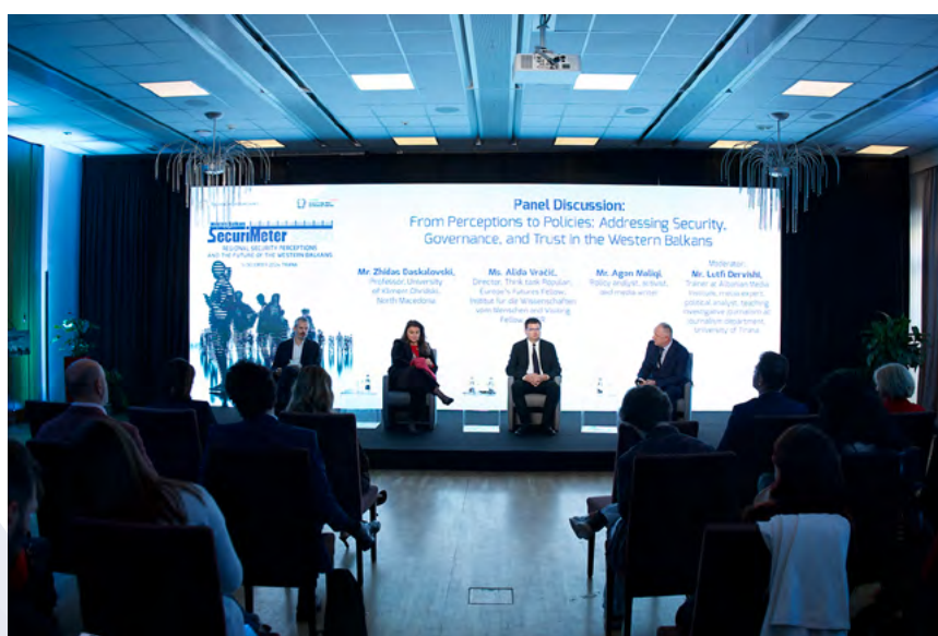
Panel discussion "From Perceptions to Policies: Addressing Security, Governance, and Trust in the Western Balkans" at the SecuriMeter 2024 data presentation, on 16 December 2024 in Tirana

The 14th Meeting of the Heads of the Security Authorities of SEE (SEENSA) was held on 16-18 October 2024 in Sofia, under Bulgarian Co-chairmanship-in-Office. The meeting focused on good practices and innovations in classified information