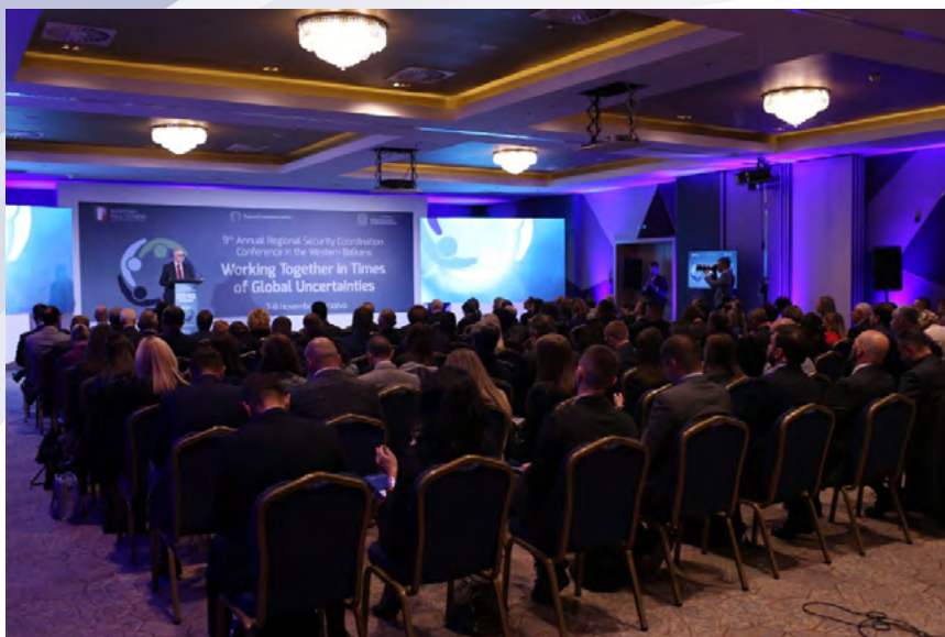
9th Regional Security Coordination Conference dubbed "Working Together in Times of Global Uncertainties" took place on 7 November 2024 in Sarajevo

flict between regional economies. Organised crime remains the top concern (60%), followed by poverty (49%) and corruption (48%). The survey also highlighted institutional distrust, especially among youth and residents of economically weaker areas. Despite this, over 50% of respondents supported EU and NATO integration.