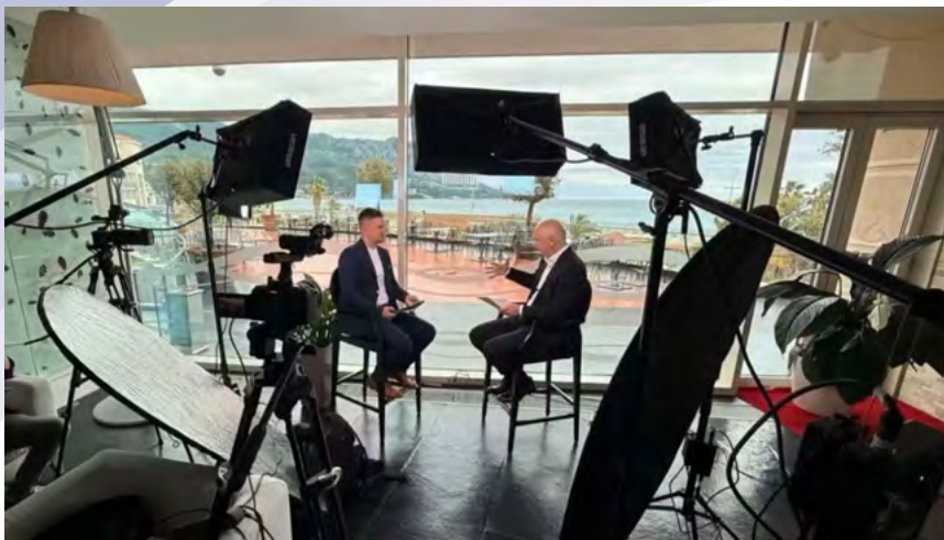
RCC organized several interviews with Secretary General and RCC staff promoting organization's agenda