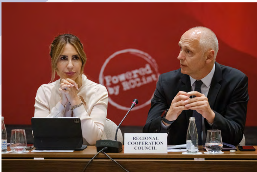
RCC Secretary General 2019–2024 Majlinda Bregu and RCC Secretary General for the term 2025–2027 Amer Kapetanovic hosting RCC Annual Meeting on 12 June 2024 in Skopje

Progress in economic competitiveness was notable: RCC facilitated the adoption of the Declaration on Regional Investment Screening Standards , launched the Western Balkans Six (WB6) Investment Incentive Platform , and coordinated investor outreach campaigns yielding over €122 million in FDI , with an additional pipeline of €466 million. The RCC also led dialogue on sustainable investment and supported joint efforts to brand the WB6 as a unified tourism destination .