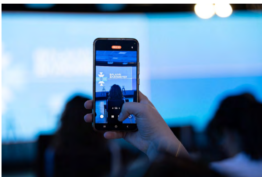
Balkan Barometer 2024 presentation held on 16 September 2024 in Tirana

high-level gathering at its Brussels office for 2025, bringing together key decision-makers from the WB6, regional partners, and representatives from the European Commission.