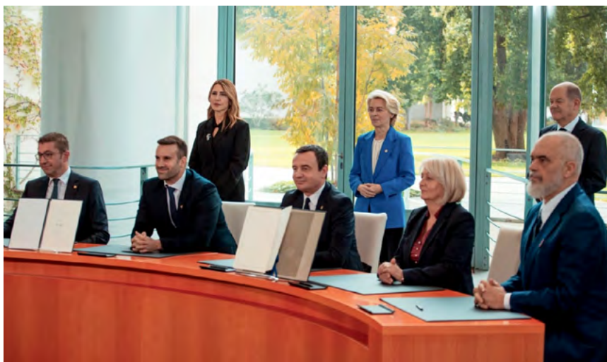
Declarations on Research and Innovation Infrastructure Access and Collaboration was adopted at the 10th Berlin Process Summit held on 14 October 2024 in Berlin

Despite these commendable developments, all WB6 remain at less than 70% of the EU's average and Emerging Innovators according to the European Innovation Scoreboard 2024 (EIS) . Serbia is ranked 4th among Emerging Innovators and 29th in the extended EIS, North Macedonia and Bosnia and Herzegovina improved their positions, with increases of 4% and 3% respectively, while Montenegro and Albania moderately improved their innovation performance. The region performs well in business process innova-