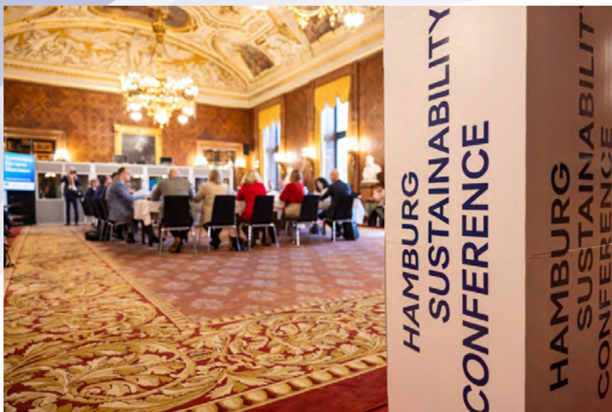
Western Balkans Six Meeting on the Green Agenda, on 8 October 2024 in Hamburg, Germany

This Declaration reaffirms the WB6's commitment to implement the Green Agenda and its 2021-2030 Action Plan, aiming for carbon neutrality by 2050. It proposes the establishment of an annual Ministerial Meeting on the GAWB to ensure political momentum and coherence, and highlights initiatives like the finalisation of the Regional Action Plan on Prevention of Plastic Pollution, including Marine Litter, and the WB6 Climate Adaptation Roadmap. It also emphasizes just transition governance, phasing out coal, establishing Monitoring, Reporting, Verification and Accreditation (MRVA) for emissions monitoring and welcomed alignment with the EU acquis, particularly on environmental standards. It underscores the role of Nature-based Solutions and the commitment to develop the Western Balkans 2030 Biodiversity Strategy.