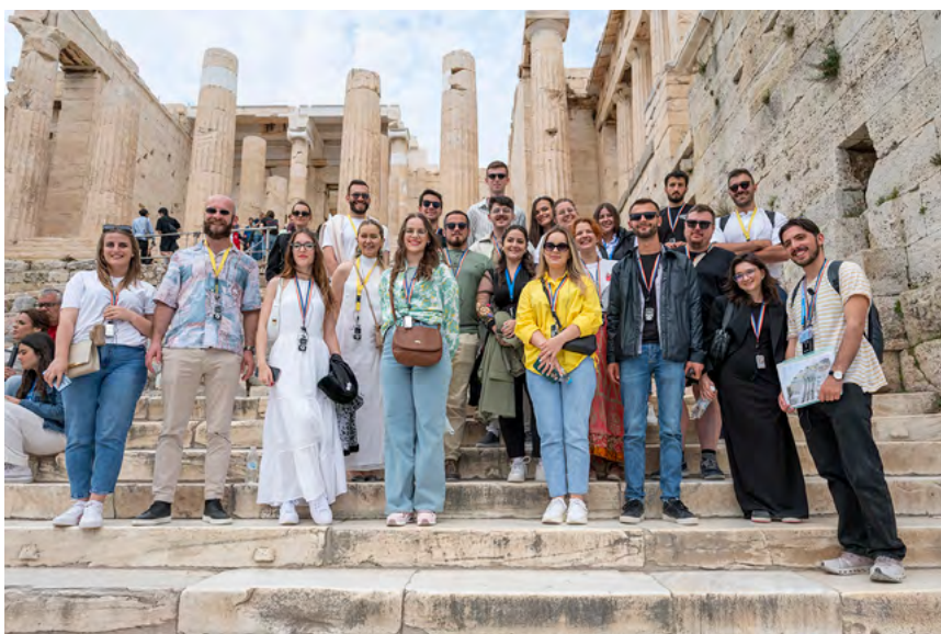
RCC's WBYL Project, in cooperation with the Hellenic Youth Council and the European Youth Forum, organised the study visit to Athens from 12 to 16 May 2025, offering representatives of Youth Councils from the Western Balkans valuable insight into EU practices and youth policy frameworks

transformative role of youth artistic expression in inspiring communities and driving positive change in the region. Emerging young artists were given the opportunity to showcase their work in a side event exhibition.