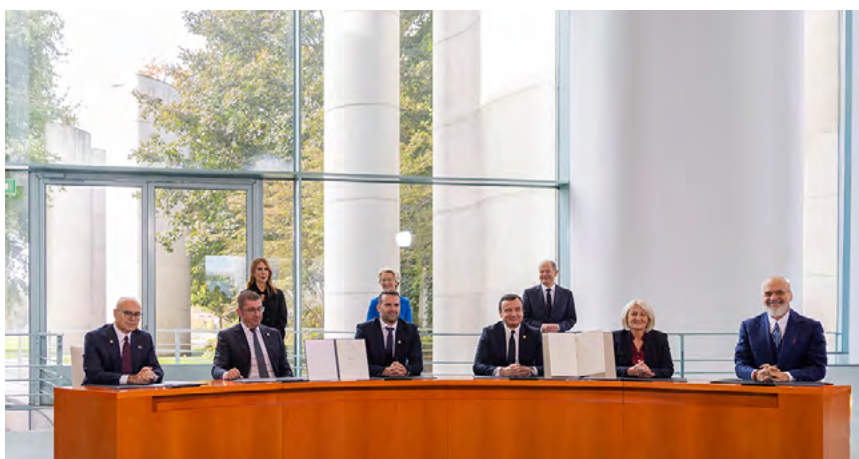
Declaration on Regional Investment Screening Standards was adopted by Western Balkans leaders at the Berlin Process Summit held on 14 October 2024 in Berlin

Another significant achievement was the launch of the WB6 Investment Incentive Platform — the first platform of its kind in the region — consolidating information on available incentives across the WB6 in one place. This initiative directly enhances investment facilitation efforts by making incentive information easily accessible to potential investors.