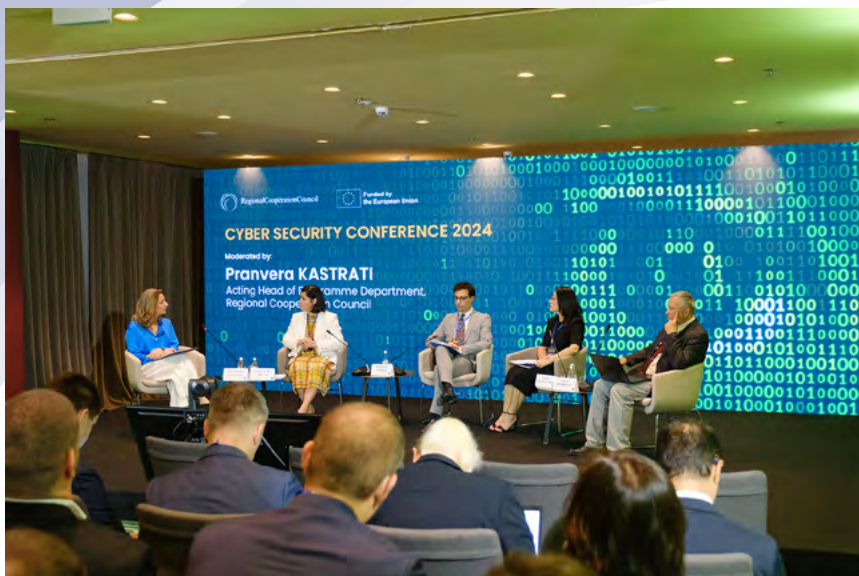
High-level panel: Strategic discussion on cybersecurity priorities in the Western Balkans region for the next four years at the second Western Balkan High-Level Cybersecurity Conference held in Tirana on 9 July 2024

The official preparations for the new cycle of the Western Balkan Digital Summit (WBDS) started with the first WBDS Steering Committee meeting, held in March 2025, with the Host of the same capital that started the first cycle, Skopje. The second WBDS Steering Committee meeting was held in May 2025, where the first draft Agenda of the WBDS was presented.