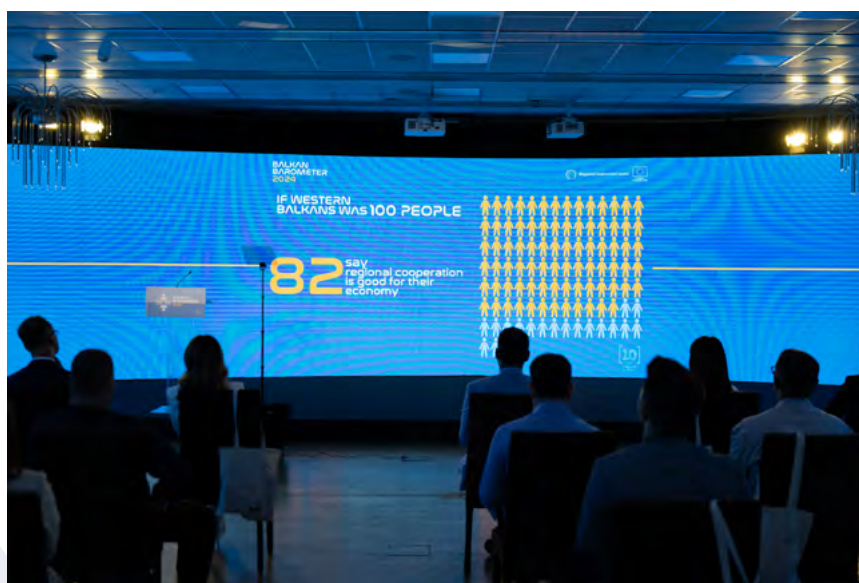
Presentation of Balkan Barometer 2024 data took place in Tirana on 16 September 2024

RCC contributed to the preparation of yet another edition of the Berlin Process. RCC supported the 10th Berlin Process summit in October 2024 by providing its inputs within CRM and GAWB and worked closely with the organisers. During the Summit, WB6 leaders endorsed several landmark agreements and initiatives facilitated by the RCC, which are expected to yield concrete benefits in the near future. These include: