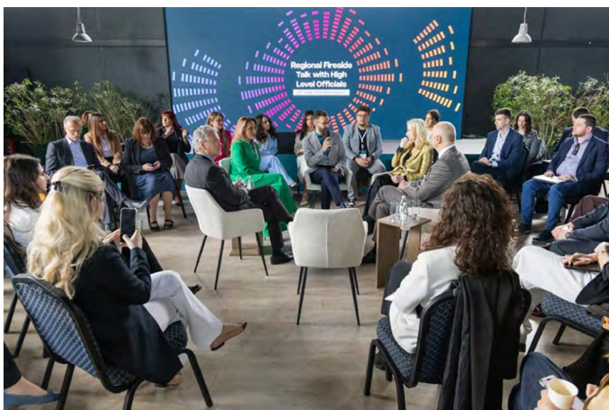
The RCC's WBYL hosted a Regional Fireside Talks with High-Level Officials on 10 April 2025 in Tivat, on margins of the ESG Adria Summit, providing over 30 young people from across the Western Balkans with the opportunity to directly engage with decision-makers in an open and youth-friendly dialogue

vocacy, preventing plastic pollution, and advancing the circular economy. These recommendations serve as the foundation for working groups in each economy of the Western Balkans, who will collaborate over the course of a year to develop solutions for these critical issues. Prior to the launch of the Youth Policy Lab on the Green Agenda, a training session was held to engage participants using interactive methods that challenged their knowledge and fostered critical thinking on youth involvement in environmental policies.