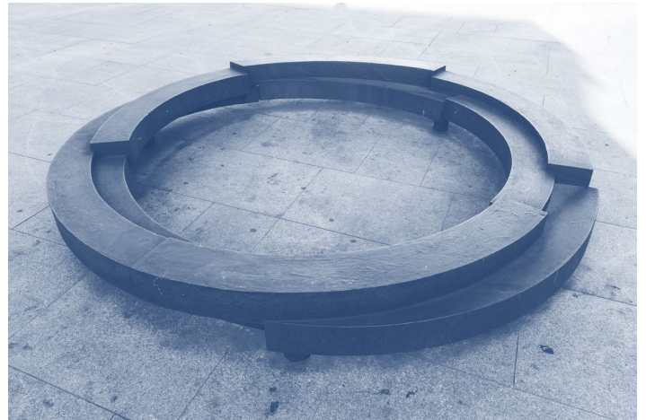
The Wheel of the Roma, Memorial to the Victims of the Holocaust – Bucharest, Romania.