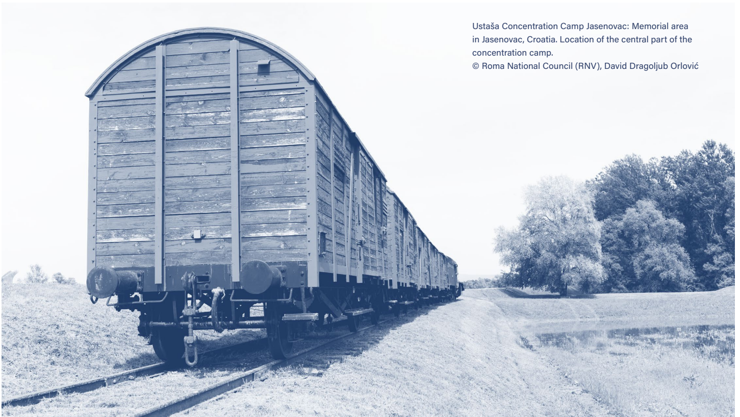
Ustaša Concentration Camp Jasenovac: Memorial area in Jasenovac, Croatia. Location of the central part of the concentration camp.