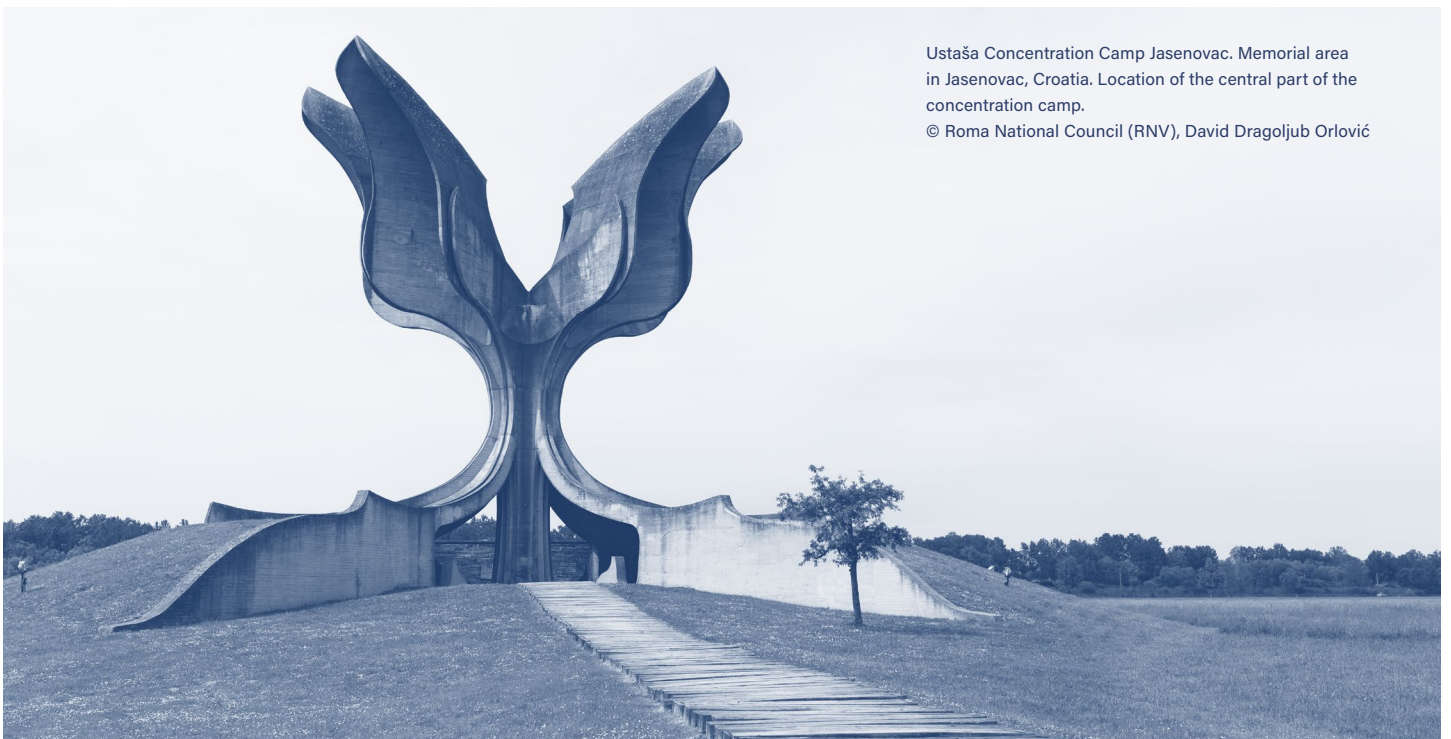
Ustaša Concentration Camp Jasenovac. Memorial area in Jasenovac, Croatia. Location of the central part of the concentration camp.

In SEE, institutions and communities have acknowledged and memorialized the victims of the Holocaust in various ways, from establishing memorial days and places