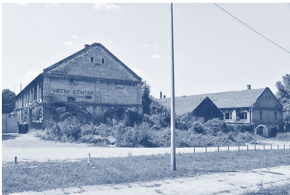
Topovske Šupe concentration camp, Belgrade, Serbia.

While Serbian Roma were interned and/or killed in concentration camps like Crveni Krst, Sajmište, Belgrade Fair Grounds, or Topovske Šupe, mass shootings of Roma took place in several other Serbian cities, such as Kragujevac, Šabac, Kruševac, Leskovac, and Niš. Roma also died in the October 1941 killings in Kragujevac and during the 1942 Novi Sad raid. 153