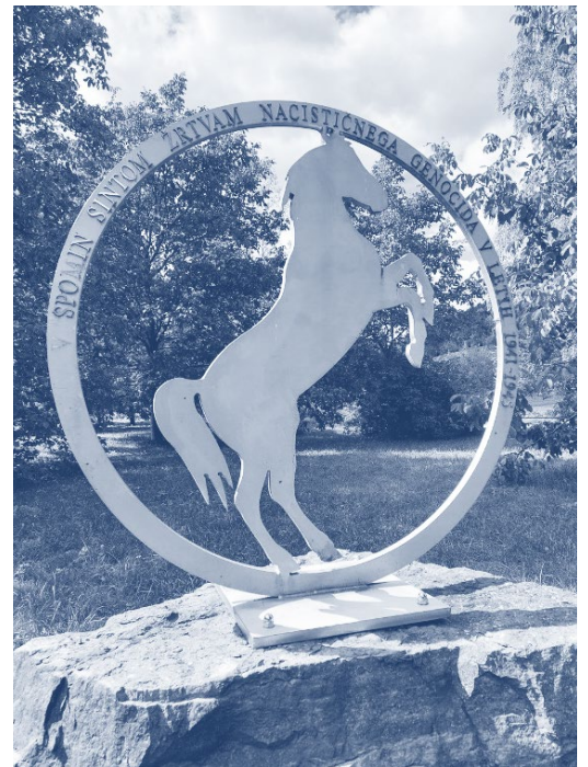
Monument at the Museum of Hostages, Begunje na Gorenjskem, Slovenia. "In memoriam of the Sinti victims of the Nazi genocide 1941-1945".