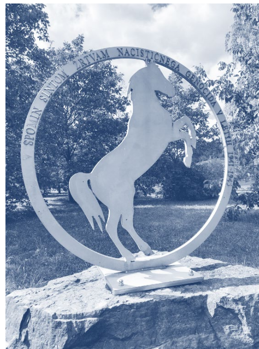
Monument at the Museum of Hostages, Begunje na Gorenjskem, Slovenia. "In memoriam of the Sinti victims of the Nazi genocide 1941-1945".