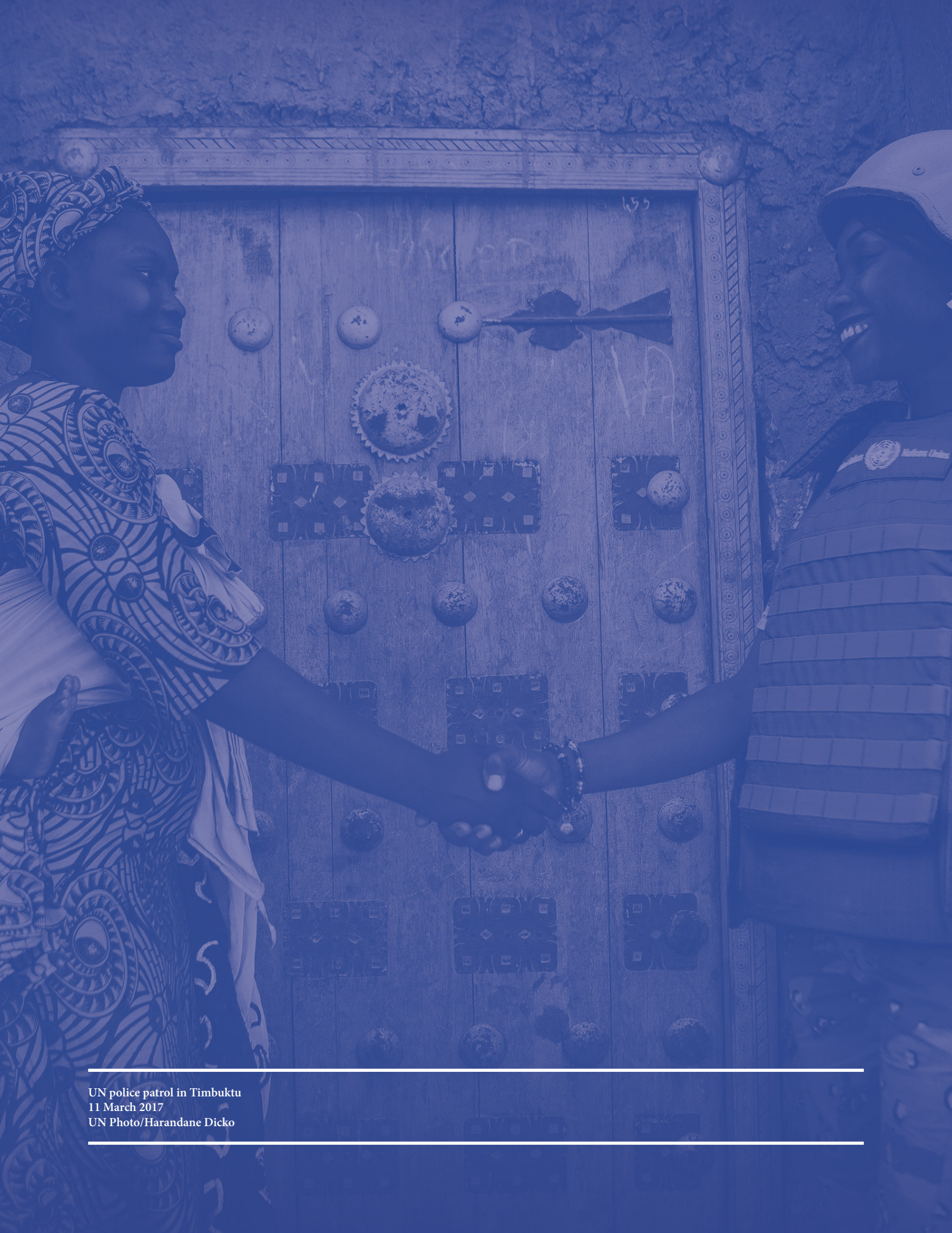
UN police patrol in Timbuktu 11 March 2017