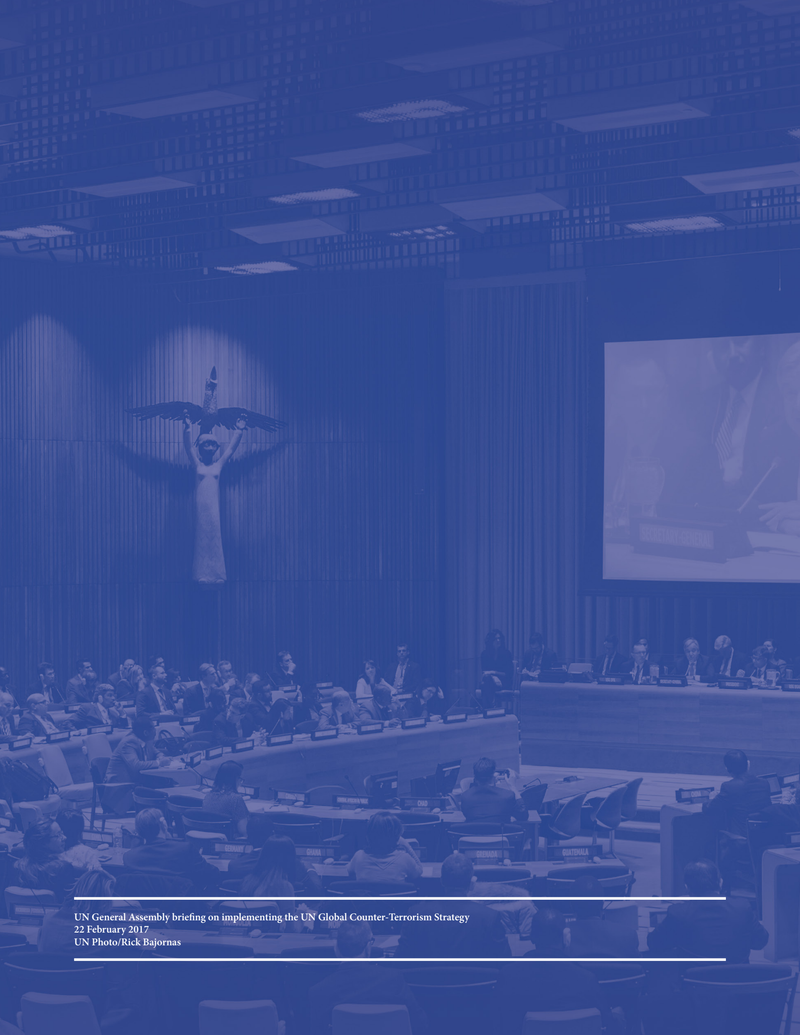
UN General Assembly briefing on implementing the UN Global Counter-Terrorism Strategy 22 February 2017