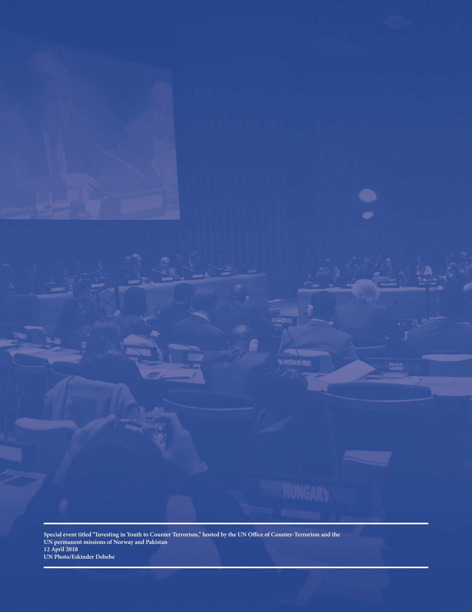
Special event titled “Investing in Youth to Counter Terrorism,” hosted by the UN Office of Counter-Terrorism and the UN permanent missions of Norway and Pakistan 12 April 2018