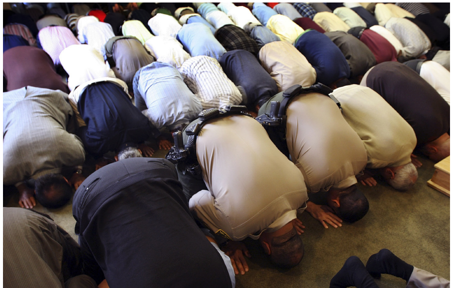
Los Angeles County sheriffs attend Friday prayers at the Islamic Center of San Gabriel Valley in Rowland Heights, California, engaging with the local Muslim community.

In 2015, the concept of CVE succeeded in establishing itself in official political jargon. In February, a three-day “CVE summit” took place in the White House, chaired by US President Barack Obama and attended by ministers from nearly 70 countries. This was followed up at the end of September by a high-level meeting on the sidelines of the UN General Assembly with the par-